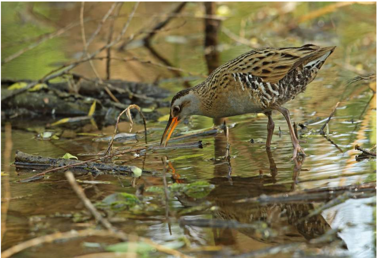
Brown-cheeked Rail - Neil Bowman

Brown-cheeked Rail Rallus indicus – Heard Beidaihe 03/05/16, 1 showed very well Happy Island 12-13/05/16 and again 18-19/05/16, heard Beidaihe 15/05/16.