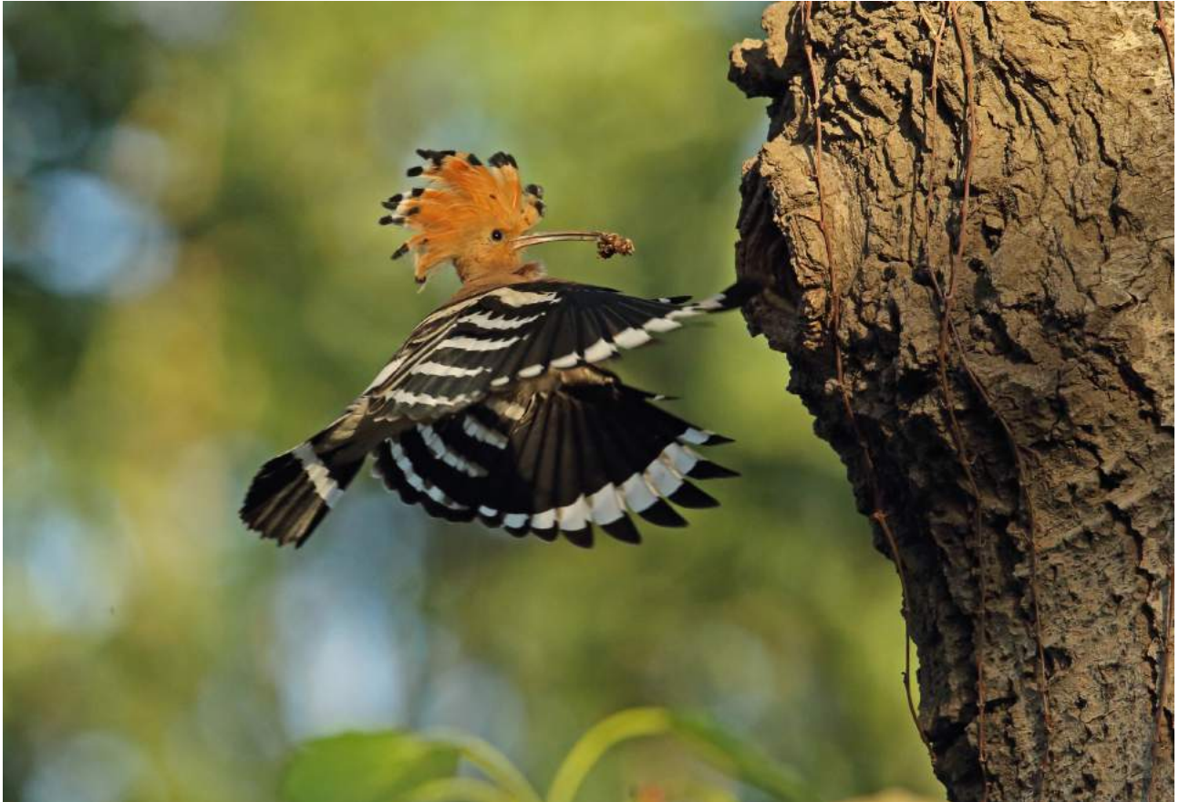
Eurasian Hoopoe - Neil Bowman

Eurasian Hoopoe Upupa epops - Breeding bird Beidaihe with several nests found with young from 01/05/16 also observed in small numbers throughout.