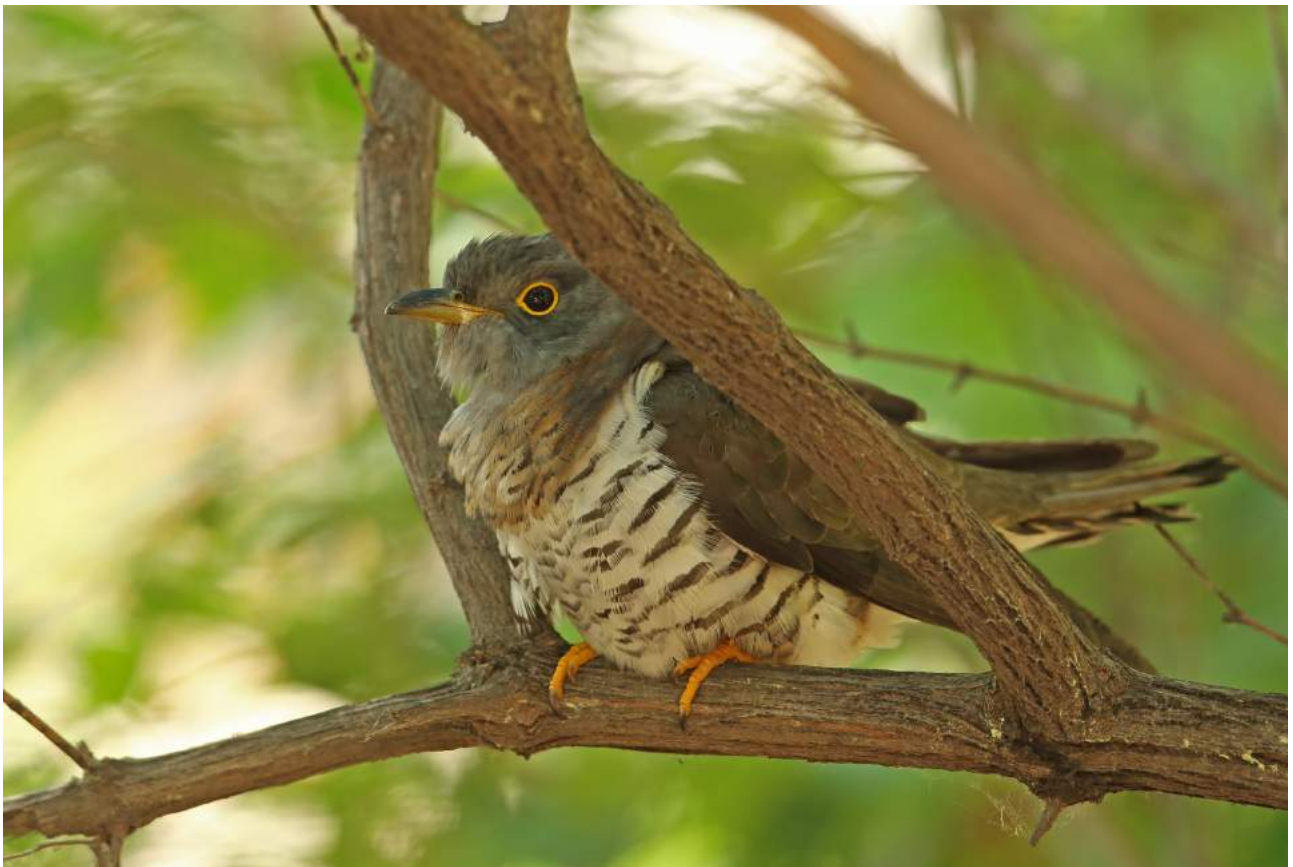
Indian Cuckoo - Neil Bowman

Indian Cuckoo Cuculus micropterus – 1 Beidaihe 15/05/16, 1 H Beidaihe 16/05/16, 1 Happy Island 18-19/05/16, 1 Beijing 21/05/16