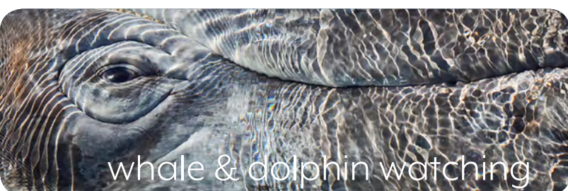
whale & dolphin watching