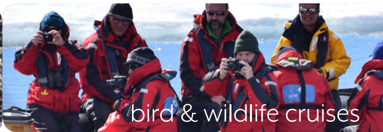
bird & wildlife cruises

Telephone: 0117 9658 333 Email: tours@wildwings.co.uk